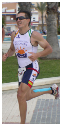
Figure 1. Triathlete during a competition.

The KT was applied for relax, to diminish the muscular tone and to avoid contractures and / or cramps during the competition (Figure 1). The aim of the study was to evaluate the subjective perception of the local pain after the competition in triathletes.